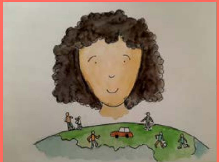
Illustration by Karan Deshpande (Std 8th, Level 3 Gifted Program)

I really have a globe on my desk, and I really do look at it. It was only on a certain day that I realized that a globe showed so many places and countries in the world, but what really makes a country or a city are the people living in it. I thought how much fun it would be if we could just see thousands, if not million people every minute going about their day. After all, there are so many different classes of people in our world based on what they eat, worship, wear, do etc. Often, we live around people like us. More than often, we see people either too different than us, or a little similar. It is a privilege to have this diversity between us, otherwise, the world would have been boring and the same everywhere. That is why I have tried to pen down my thoughts in a rhyming fashion.